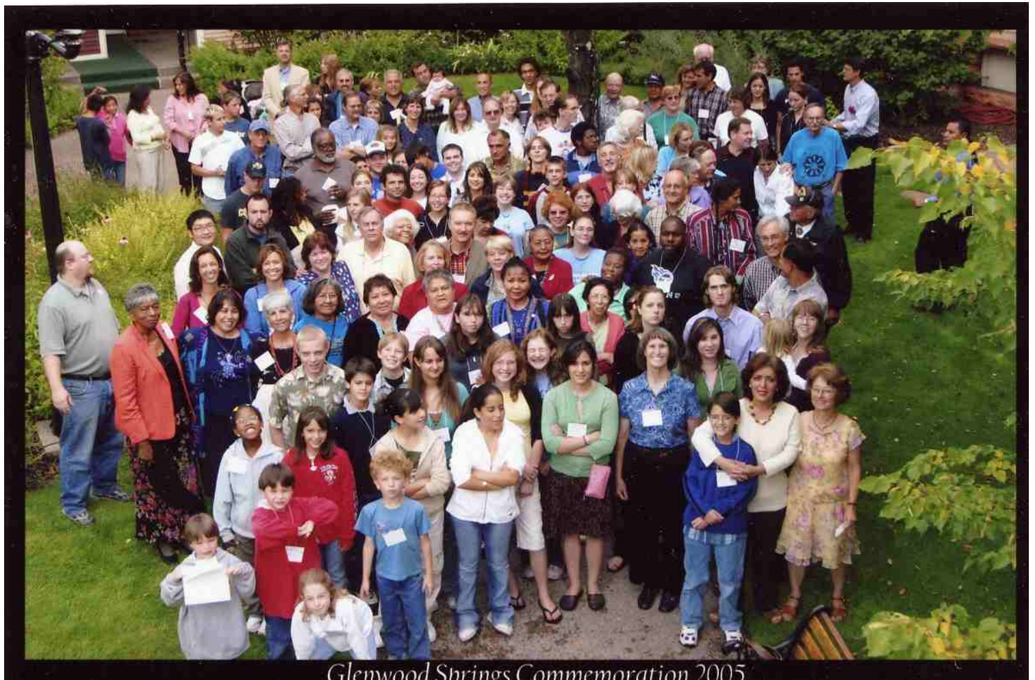
Glenwood Springs Commemoration 2005